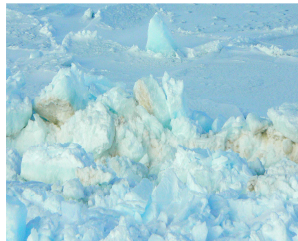
Algal Mats, Antarctica